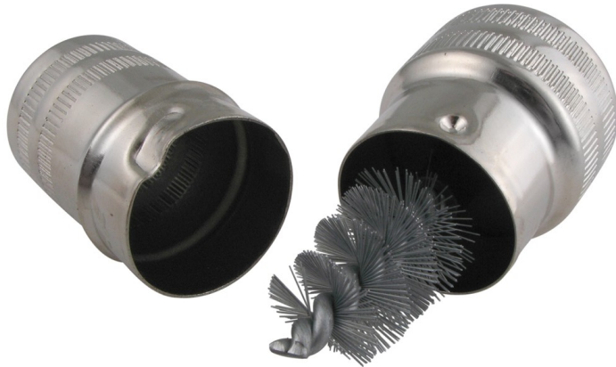
Battery Terminal Cleaner This is used to clean off dirt, grease or corrosion from the battery terminals. ~Amelia